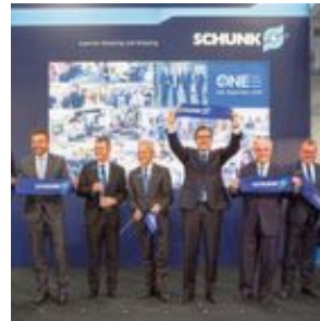
Schunk is investing 85 million euros in its production sites