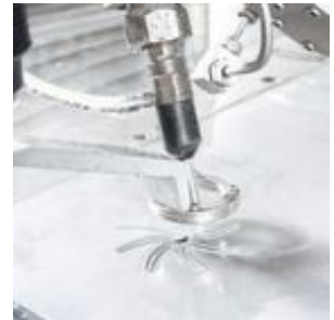
Water jet cutting - Function, methods and application examples