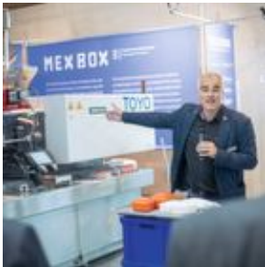
Moulding Expo is a marketplace for the industry and ideas