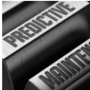
Predictive Maintenance: Efficiency in Industry 4.0